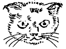
Edges 4) Folded___