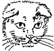
Folded 1) Forward___