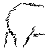
6) No Tail___